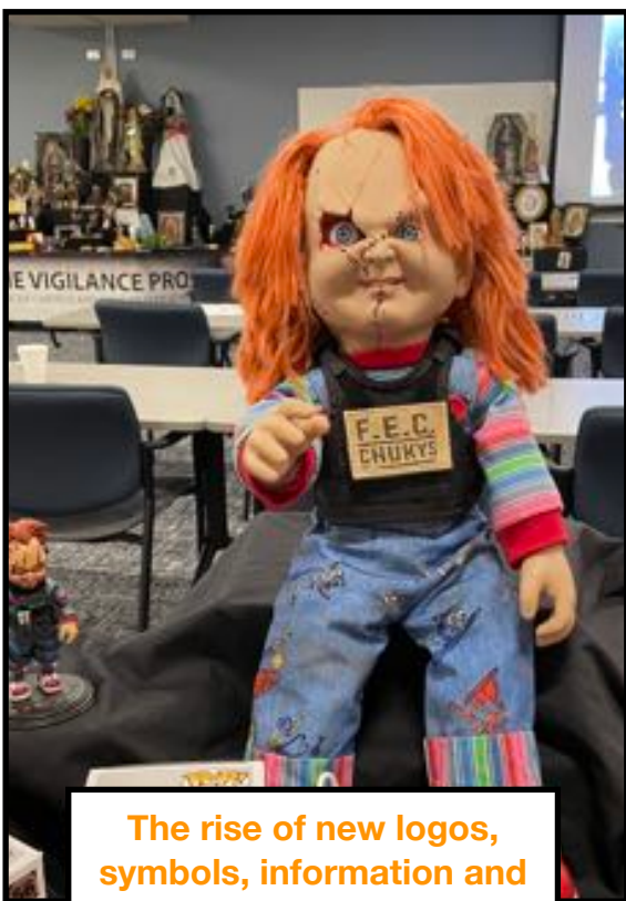
The rise of new logos, symbols, information and tactics