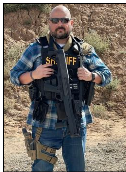
This Class is a must for all LEO!