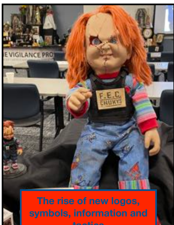
The rise of new logos, symbols, information and tactics